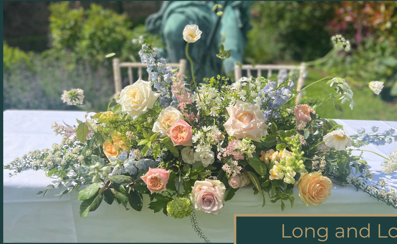
Long and Low